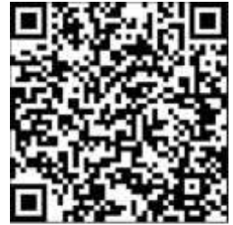
2025 ESLC Time & Talent Survey Scan to Open